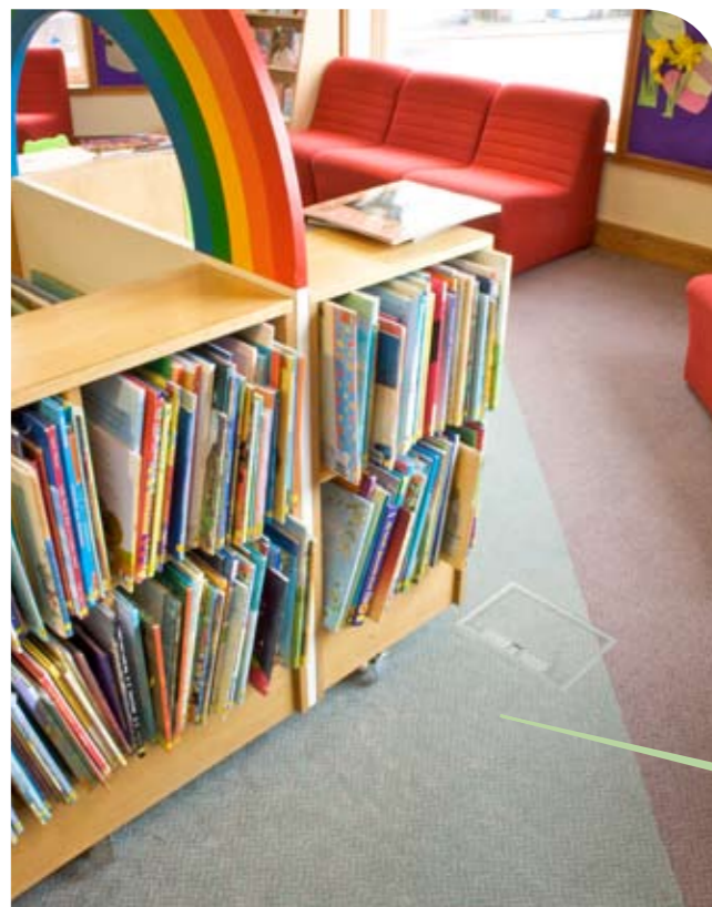
Genus carpet is produced with Marquesa yarn which is easy to clean and maintain and is inherently resistant to staining and fading.