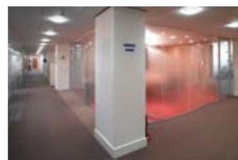
Department For International Development East Kilbride

The Abercrombie House Project Team included representatives from DFID, the Office of Government Commerce, Turner and Townsend, GVA Grimley and the main contractor ROK/Dickie. The carpet was installed by a team from the Glasgow office of Veitchi Group.